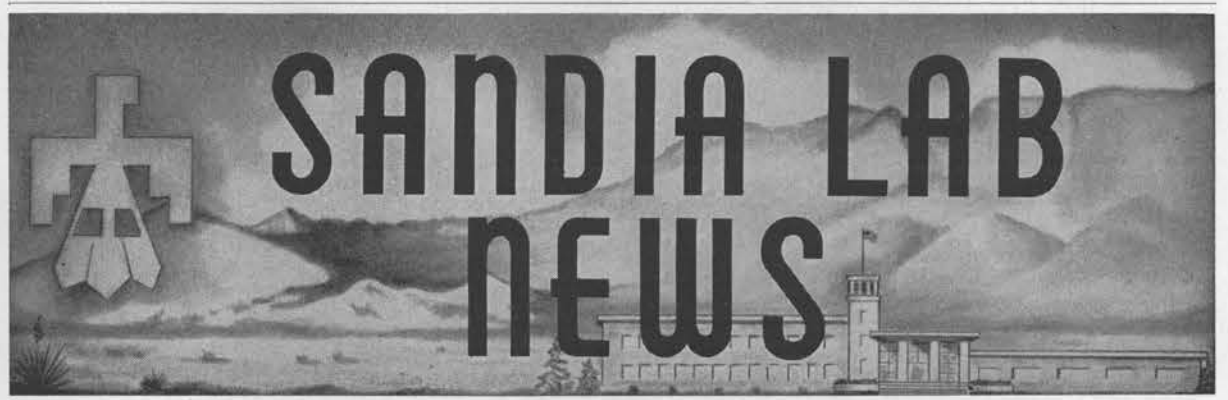
published every other friday for the employees of sandia corporation, contractor to the atomic energy commission